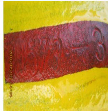
Crane no.4 SB70 shackles U573-3