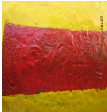
Crane no.4 SB70 shackles U573-2