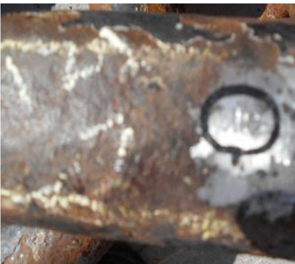
NO. 1 LOWER SHACKLE