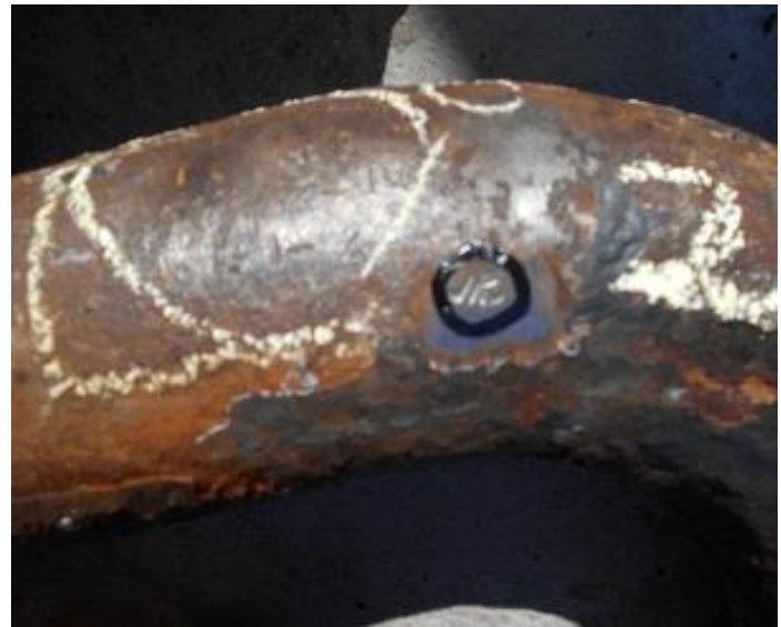
NO. 1 UPPER SHACKLE