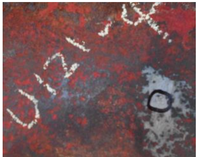
NO. 1 CARGO HOOK

These had to be remarked in a different area and a Class NK surveyor had to attend to verify the new stamps before cargo could be worked.