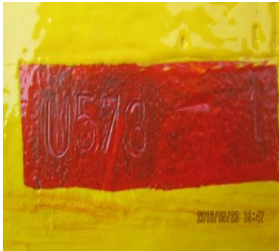
Crane no. 4 sheave block U573-1