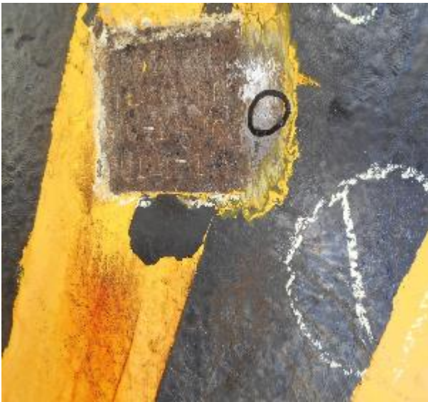
NO. 1 CARGO BLOCK

Please be aware that one of our vessels in Brisbane, Australia was off hired recently due to the cargo loose gears distinguishing marks on the sheave block, shackles and hooks not being fully visible as they had rusted away. Refer below photos.