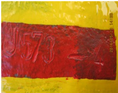
Crane no. 4 hook U573-4